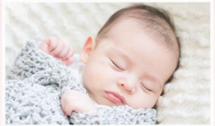
Another of our precious True Care babies