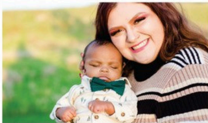
Meet some of our beautiful True Care Babies

*All stories are shared with patient consent; however, names and certain details have been changed to protect confidentiality.